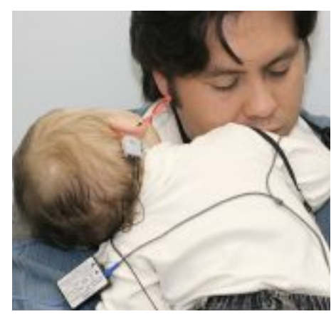
Wireless recording enables parent to hold baby.

the Integrity compared to conventional ABR technology. Meyer et al<sup>4</sup> reported "statistical significance and notable clinical trends favoring the Vivosonic performance when subjects were engaged in an activity."