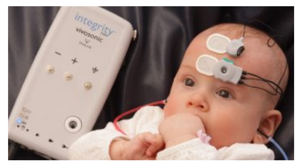
Diagnostic ABR without sedation using Vivosonic Integrity.

complete 110 ABR assessments, which are reported below.